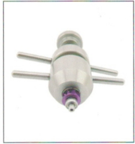
3.) Put the bearings inside the chuck