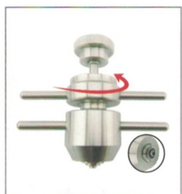
6.) Unlock the bearings