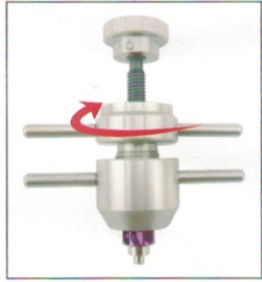
4.) Lock the chuck to hold the bearings tightly.