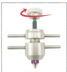
5.) Turn the pushing screw to push the spindle out of the bearings