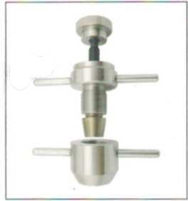
2.) Mount the chuck