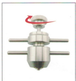
7.) Turn the pushing screw again to push the bearing out of the chuck