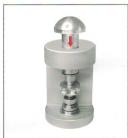
8.) Use the tool to press the bearing on the rotor